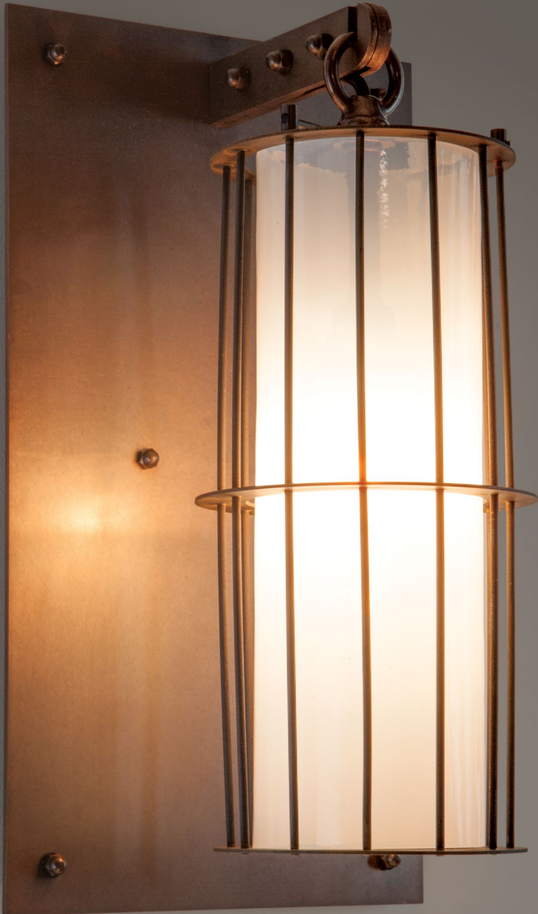
Shown: 5" model in Deep brown oxide and Opal white glass.