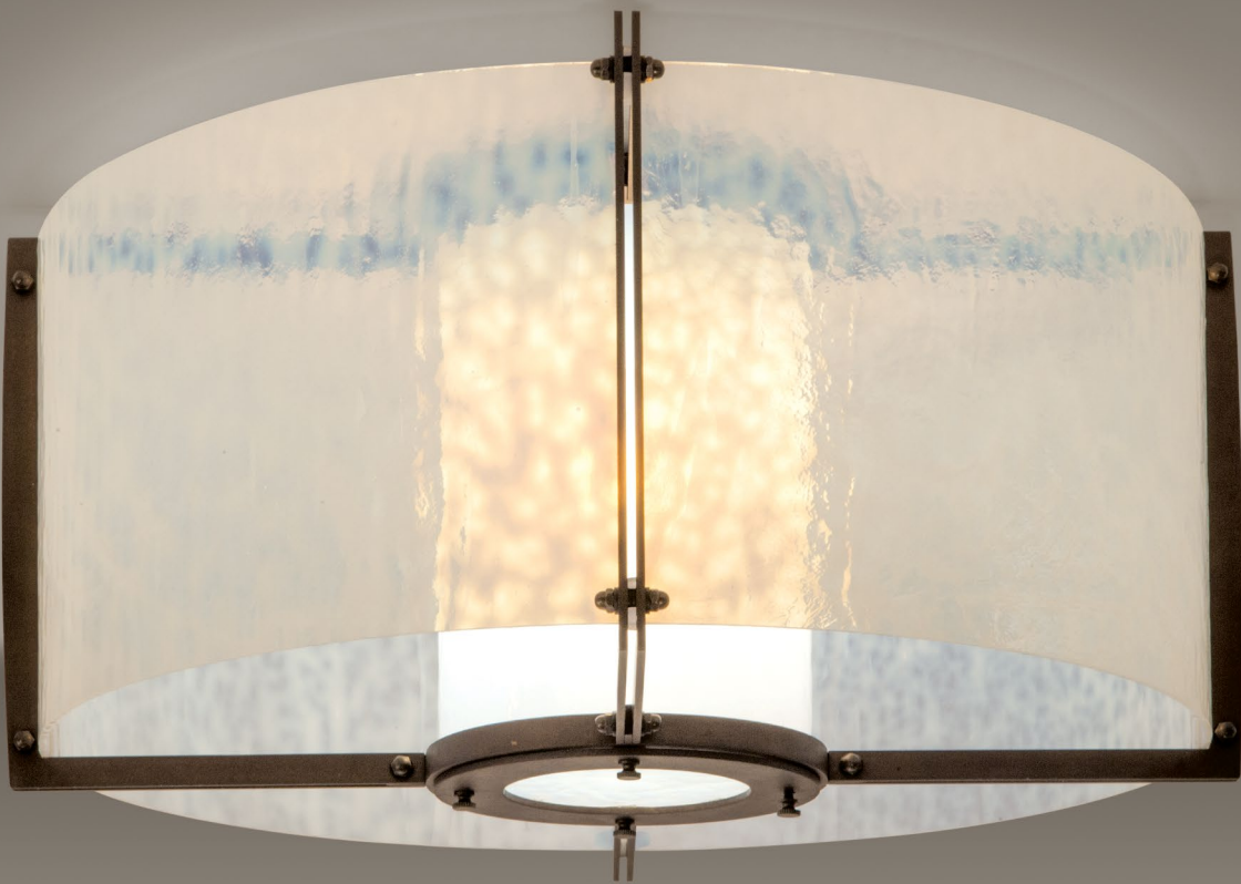
Shown: Deep brown oxide and Opal white glass.