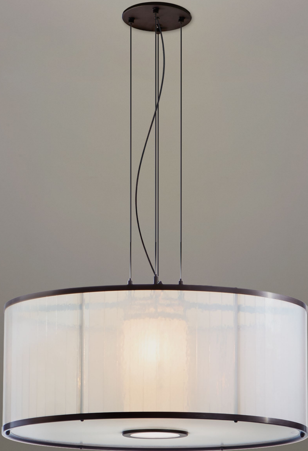
Shown: 24"Ø model in Deep brown oxide and Seeded opal glass, with cable suspension.